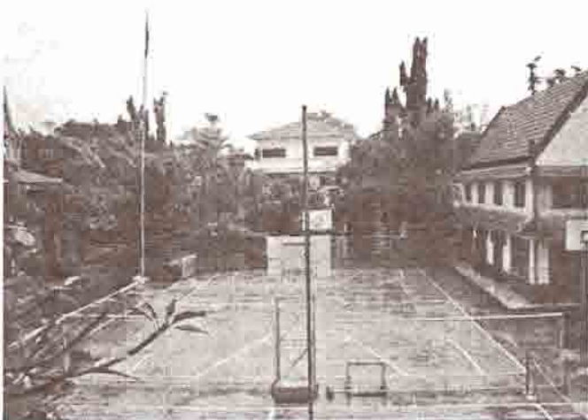
The school's basketball court is put to good use every day.

that the landing is anything but comfortable. Many of the students playing have massive, strong arms and